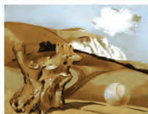
Event on the Downs. Paul Nash. 1934.