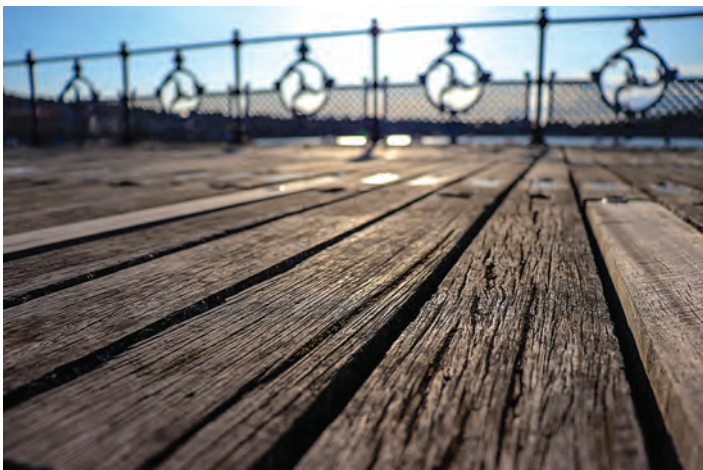
Category: 'A LINE' - winner: Bethany Woodward