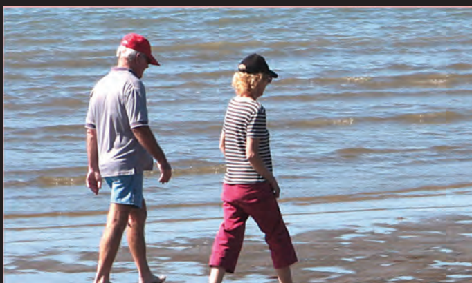
Pastimes And Pleasures Pg 21 - 29

FREE WHERE DELIVERED. POSTAL SUBSCRIPTION AVAILABLE at: www.purbeckgazette.co.uk/catalogue.aspx