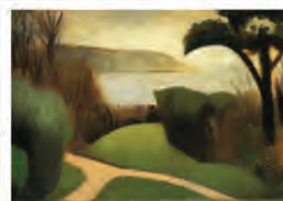
Near Swanage. Mark Gertler. 1916.