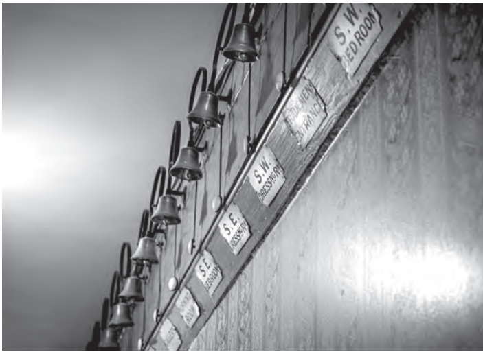
Category: 'HISTORY' - winner: Graeme Neale