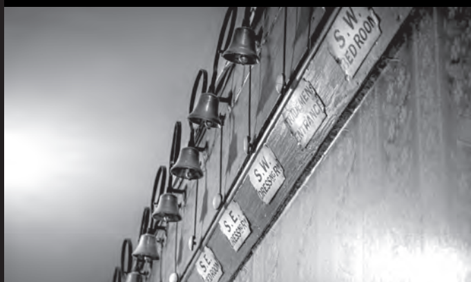
Photomathon Results! Pg 48 - 49