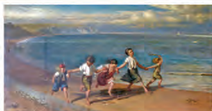
Come into these yellow sands. Walter Field. 1873.