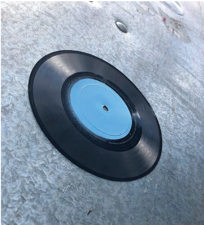
Category: 'MUSIC' - winner: Rob Senior

(Some images produced here have been slightly cropped to fit the space - none have otherwise been altered).