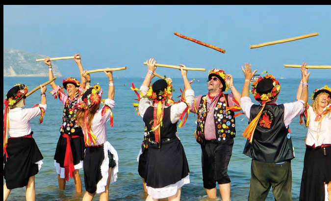
Swanage Folk Festival 2019 Pg 44