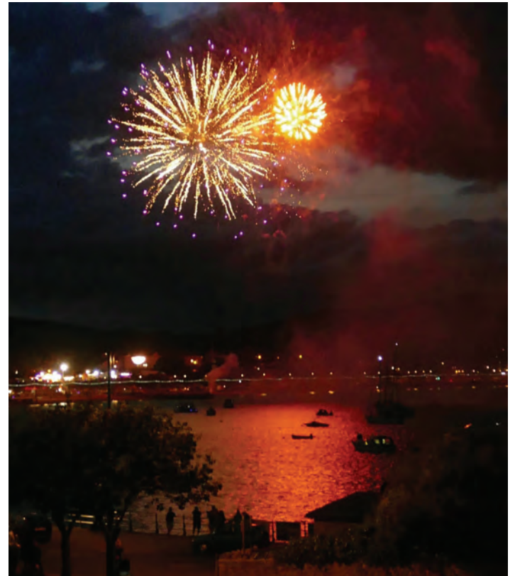
Category: 'OFF WITH A BANG' - winner: Carol Wadsworth