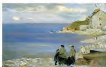
Swanage. Charles Conder. 1900.

See Swanage through the eyes of famous painters through the years