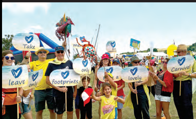
Sustainable Swanage! Pg 17