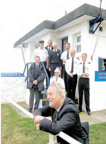
Official Reopening.

The station had also been redecorated inside and out, standing proudly on the exposed headland it inhabits, at an elevation of 320ft on the cliff edge (pictured, below left).